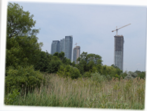
Urban in Mind Professional Urban Planning, Land Development & CPTED Consultants

Urban in Mind is a Boutique Urban Planning, Land Development and CPTED Consulting firm specializing Property Investigation, Land Development, Municipal Approvals, and CPTED Audit/Reviews.